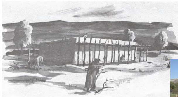
El Cuartelejo pueblo as it may have appeared when occupied.