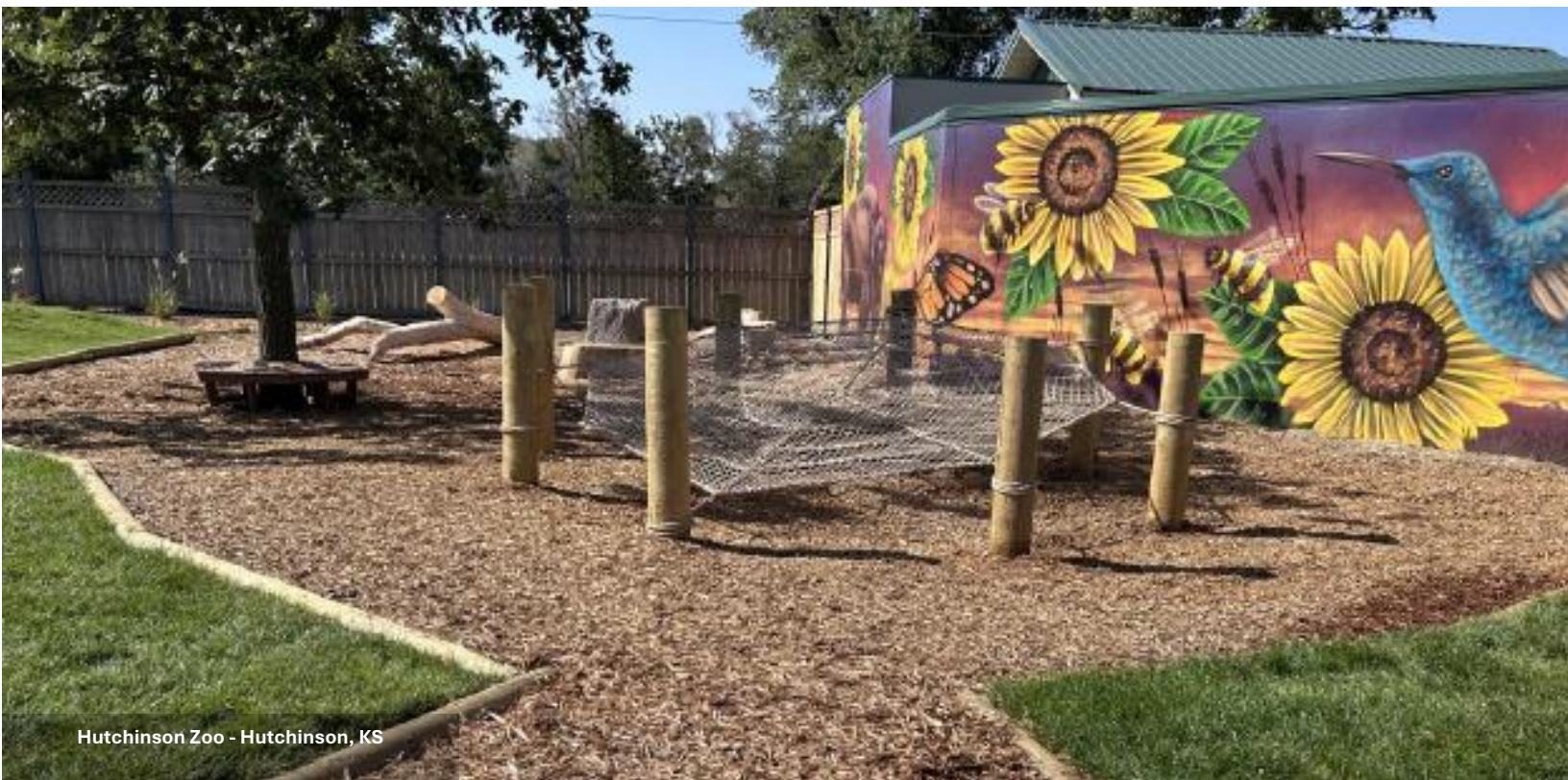
Hutchinson Zoo - Hutchinson, KS

KDWP grant staff are available to assist potential applicants throughout the application process. This includes guidance on project development, proposal preparation, understanding project evaluation criteria, and overall grant management. Applicants are encouraged to seek technical assistance to ensure their projects align with program requirements and maximize their potential for funding. KDWP staff are committed to providing the necessary support to facilitate successful project applications and implementation.