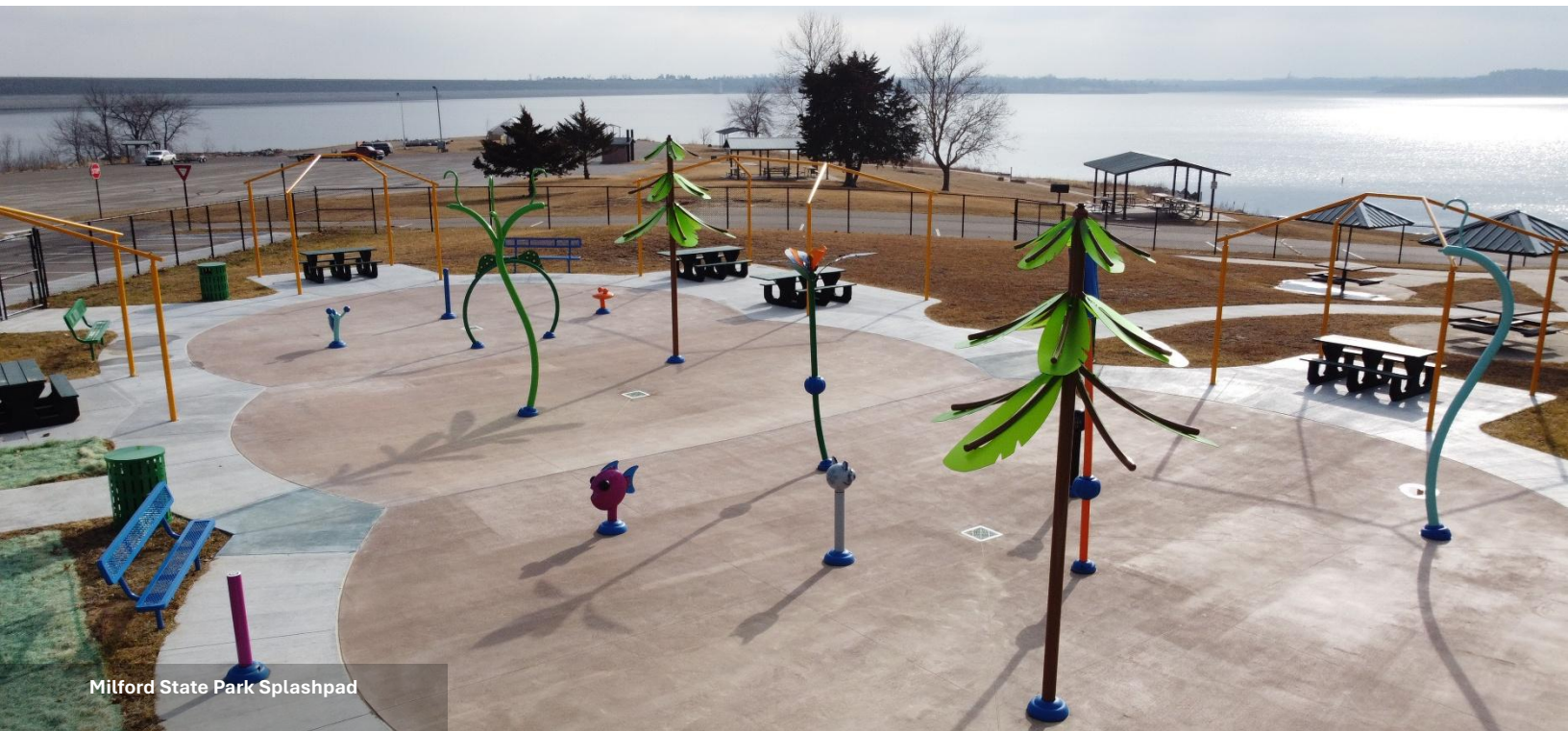
Milford State Park Splashpad